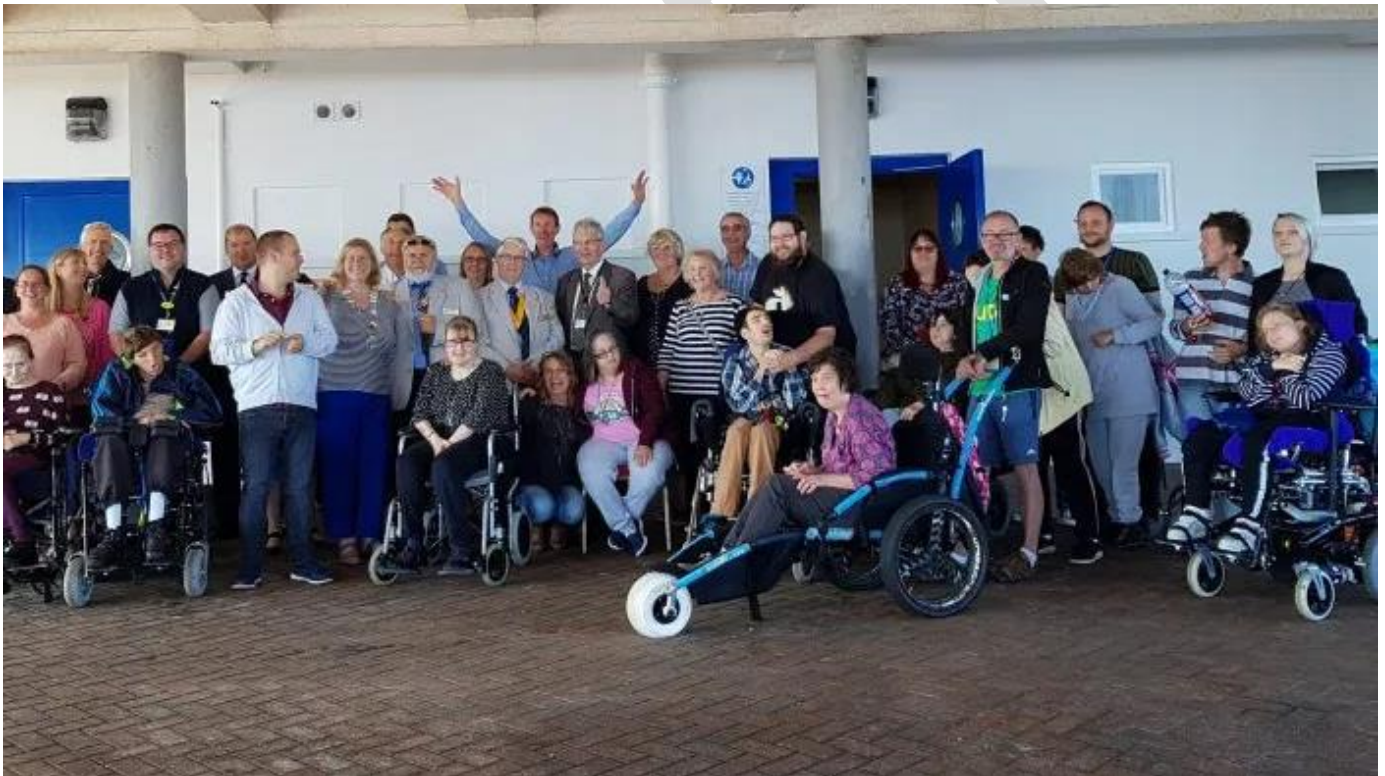
The opening of the Changing Places toilet Paignton Sea front

For further information please visit www.torbay.gov.uk/changingplacestoilets TBC or contact Torbay Council, via planning@torbay.gov.uk or phone 01803 207801.